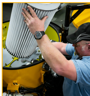
Easy Filter Access