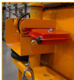
Full Explosion-Proof Options List